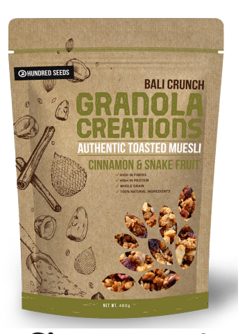
Cinnamon & Snakefruit