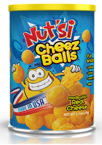
Nut'si Cheeseballs Real Cheese