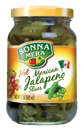
Sonnamera Jalapeno Slices

The Sonnamera pickles range includes Sonnamera Sweet and Sour Gherkins, Jalapenos, Cornichons and several more. Sonnamera pickles are gluten free, lactose-free and suitable for vegetarians.