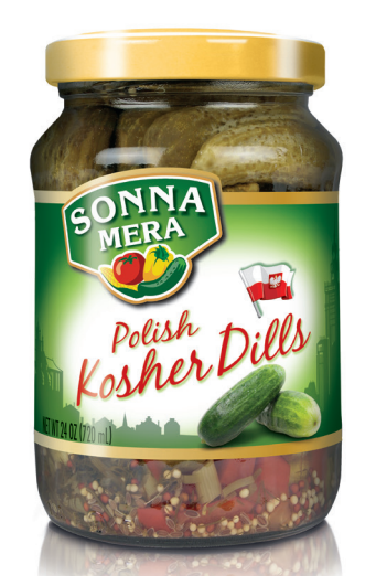
Sonnamera Polish Kosher Dills