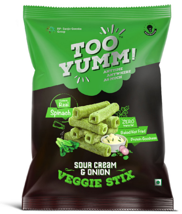
Sour Cream & Onion