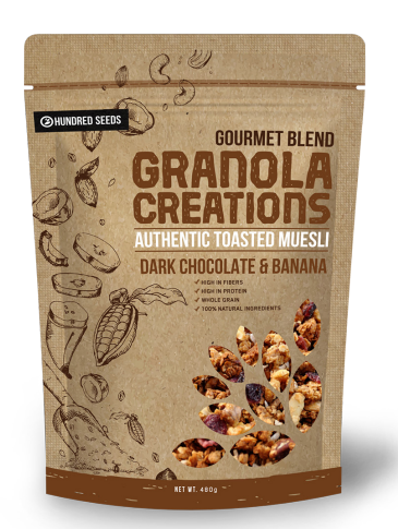
Dark Chocolate & Banana

High in fibres, High in Proteins, Whole Grain granolas and 100% natural ingredients. Comes in 5 different flavours.