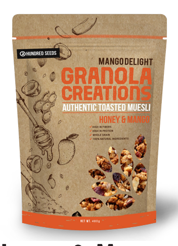
Honey & Mango