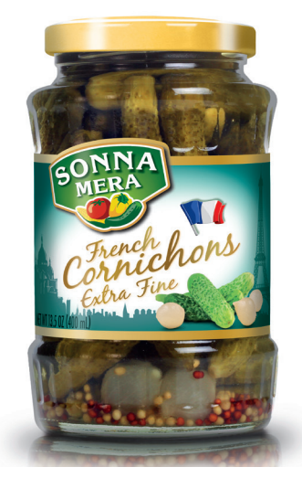
Sonnamera French Cornichons Extra Fine