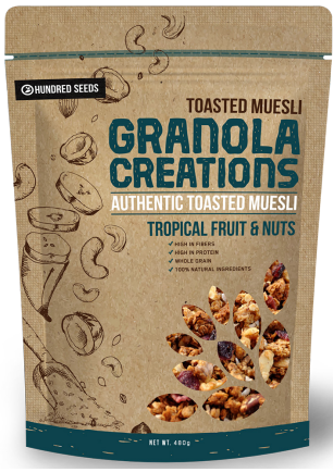
Tropical Fruit & Nuts