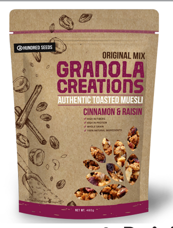
Cinnamon & Raisin