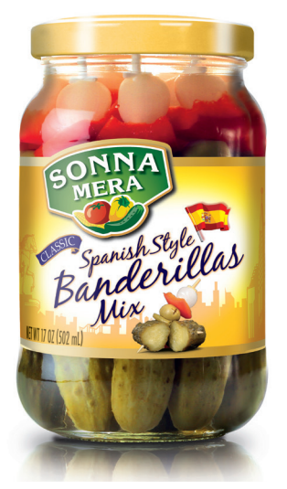
Sonnamera Spanish Style Banderillas Mix