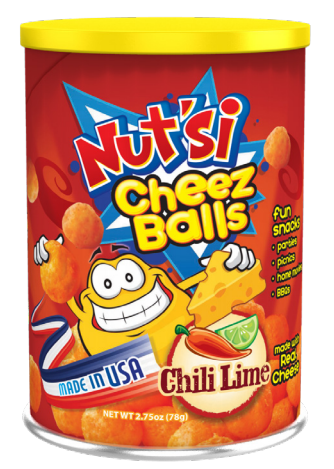
Nut'si Cheeseballs Chilli Lime

Nut'si fun snacks comes in 4 different flavours, chilli lime, jalapenos and real cheese. A favourite snack for the young and old alike!