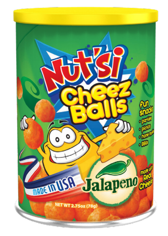
Nut'si Cheeseballs Jalapenos