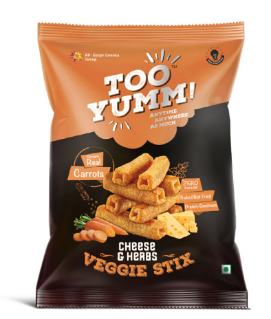
Cheese & Herbs

Too Yumm! Veggie Stix are baked extruded snacks with zero trans fat and protein goodness!