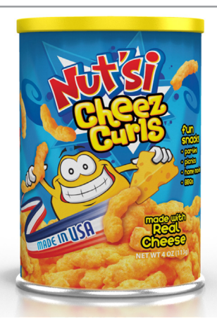
Nut'si CheeseCurls Real Cheese