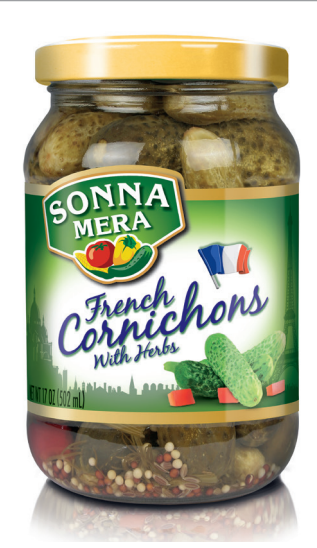
Sonnamera French Cornichons with Herbs