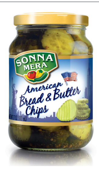
Sonnamera American Bread & Butter Chips